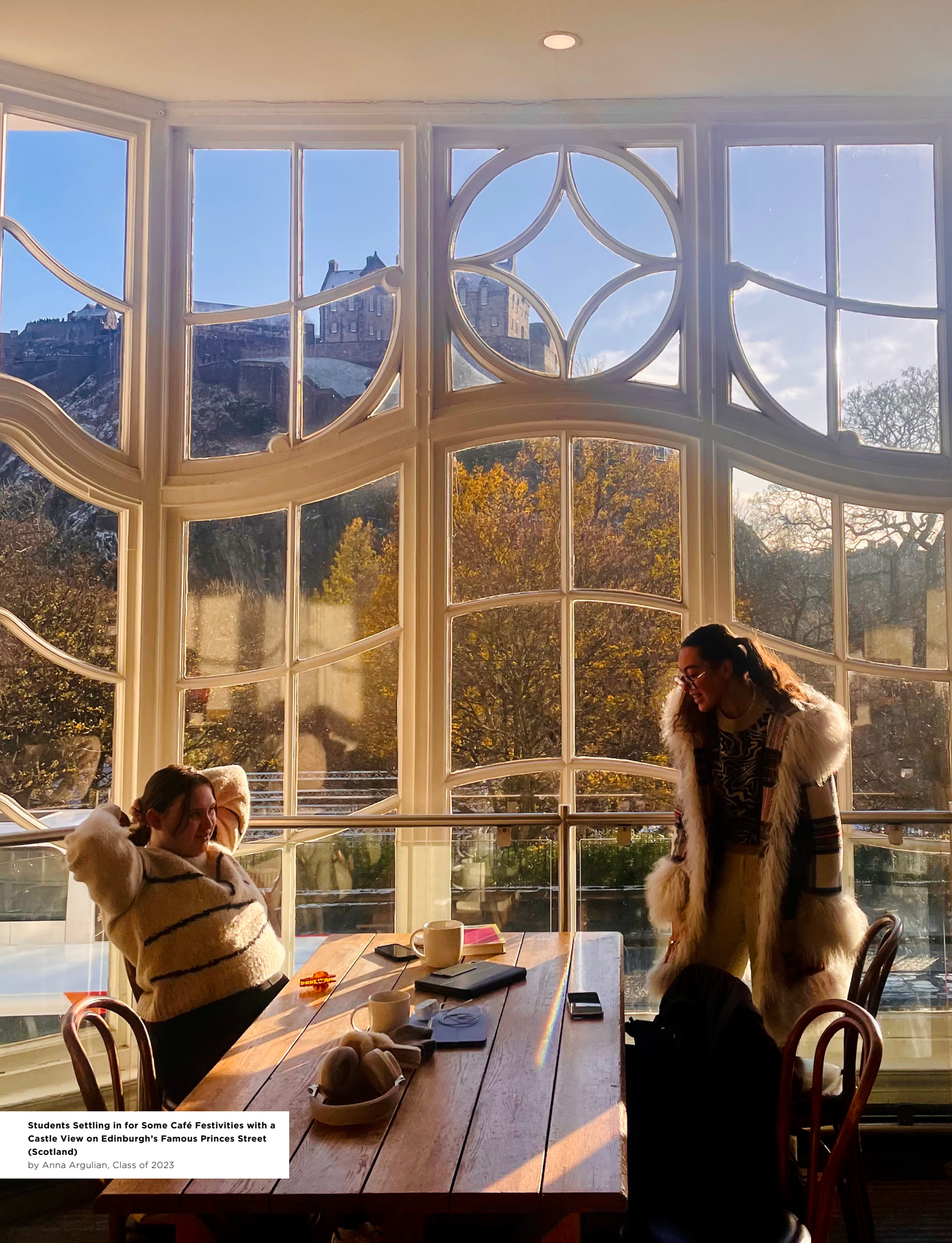
Students Settling in for Some Café Festivities with a Castle View on Edinburgh's Famous Princes Street (Scotland)