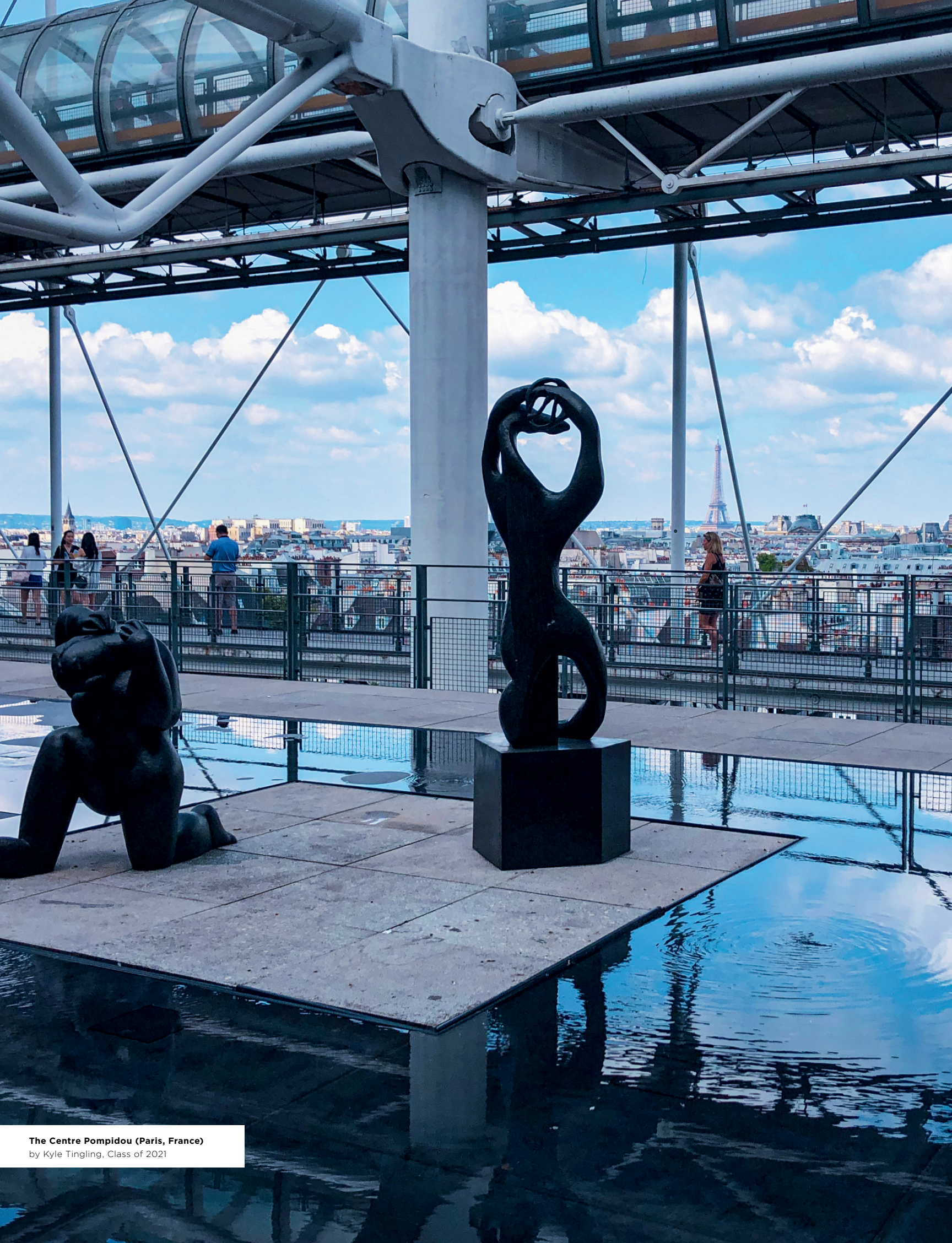
The Centre Pompidou (Paris, France)