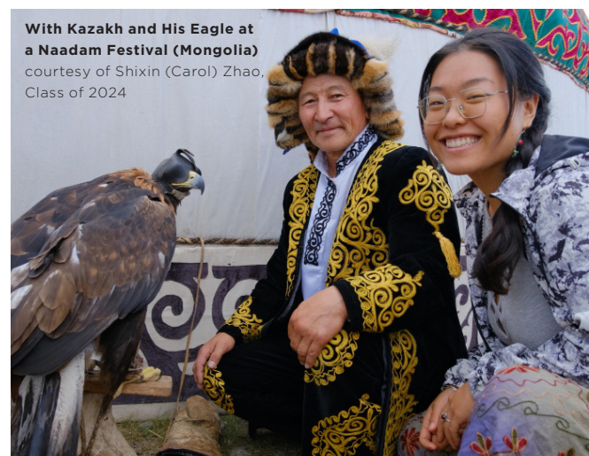
With Kazakh and His Eagle at a Naadam Festival (Mongolia)

Conduct independent research in all corners of the world, from field archaeology in Peru to molecular dynamics in Sweden. Often this work leads to a BA paper.