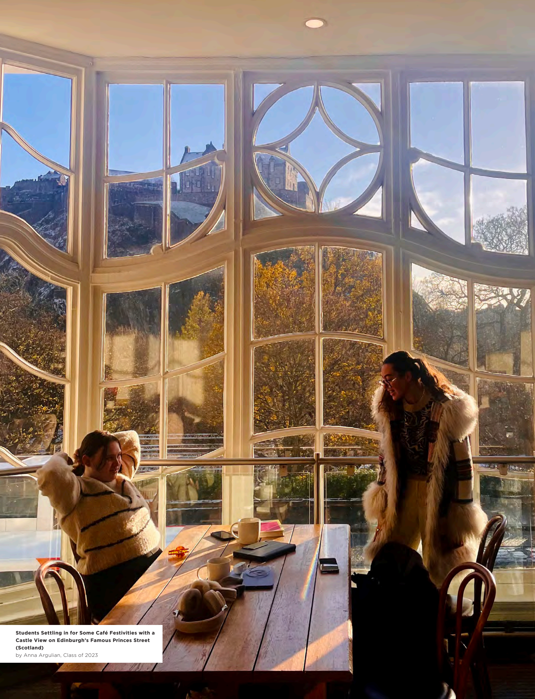
Students Settling in for Some Café Festivities with a Castle View on Edinburgh's Famous Princes Street (Scotland)